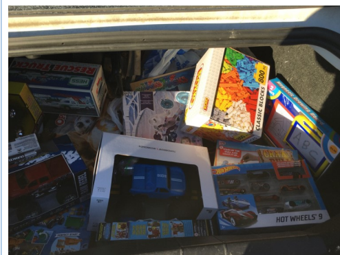
Donations on their way to Toys For Tots.