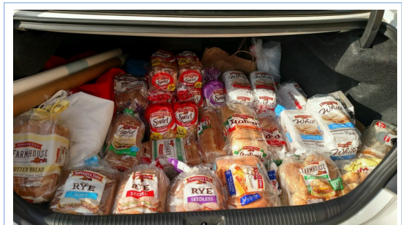
Bread ready for Christmas Eve delivery.