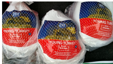
Some of the Thanksgiving Turkeys and Christmas Hams.