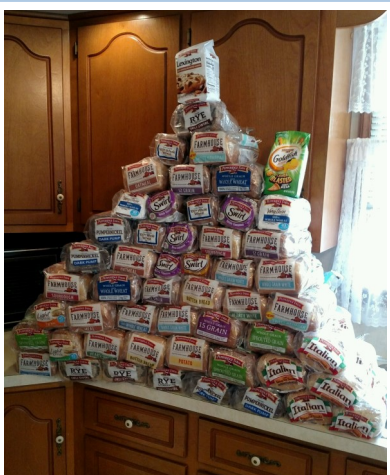
Bread and goodies piling up before Thanksgiving.

It was a blessing to see the grateful look on the faces of everyone. This out reach put everything in perspective of what the thanksgiving spirit is all about and it made us more aware of how blessed we are and helping others in true need is very humbling.