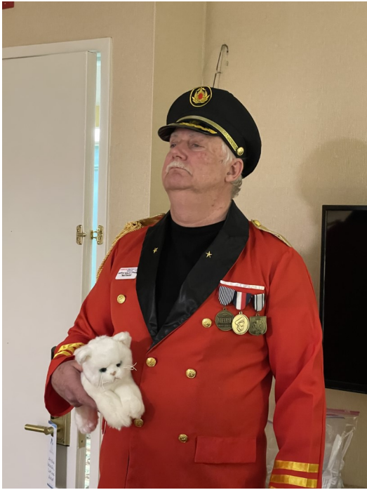
More photos from D5 Spring Conference and DSPS Hospitality Suite on pages 10/11