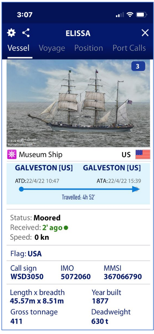
ELISSA TODAY ON MARINE TRAFFIC APP

Thus, Elissa began her new life in a second century of sailing, as a part time sail training ship and living history museum. She has made long cruises over these years, including the trip to NYC in 1986 for the Statue of Liberty's 100<sup>th</sup> anniversary. She continues to hold sail training and conduct days sails every year in the spring. As of this writing, she is in dry dock at Todd Shipyard across bay from Galveston for routine maintenance.